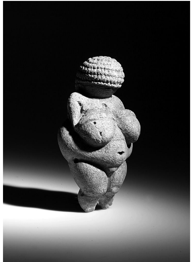
Venus von Willendorf (© The Natural History Museum, Vienna).

The interpretations, which have been formulated up to now, vary from fertility or religious rituals to pornography. The figurines are said to be the archetypal “Great Mother” or prove the existence of a matriarchy. Venuses are said to have been important in (mating) networks, have served as instruction materials for pregnant women or played a role in initiation rites. Former scientists also saw the representation of the various races in the figurines. The figurines were also seen as carriers of “time-factored” symbols and some scientists claim that the meaning and function of the Venuses never can be established with complete certainty. The most recent, original interpretation of the Venus figurines was published in 1996 by the American art historian LeRoy McDermott. In his opinion, the Venus figurines were created by women as a form of self-representation.