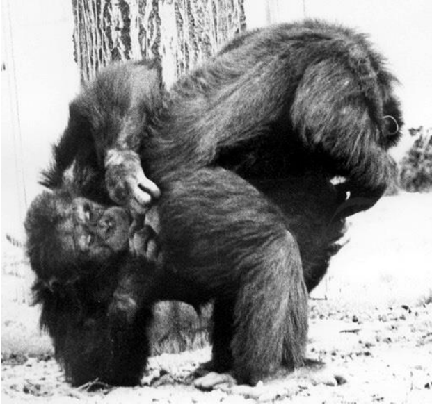
Two male chimpanzees from Arnhem Zoo, Luit and Nikkie, struggled for power for a long time. Between their fights they could hardly wait to reconcile and groom each other's anuses. In the picture, they are literally brown-nosing.

Warding-off evil is the engine behind all cultural expressions including religion, rituals, and art, according to the German cultural theorist Abraham Warburg. The Austrian human ethologist Irenäus Eibl-Eibesfeldt and the Swiss art historian Christa Sütterlin devoted a monograph to angst and apotropaic symbolism in 1992. This work shows many examples of figurines (mainly from the Neolithic period) with an apotropaic meaning. In his “ Biologie des menschlichen Verhaltens ” (Biology of Human Behavior) (1995) Eibl-Eibesfeldt refers explicitly to our ancestor shared with non-human primates when understanding human behavior. This is true, for example, regarding the calming effect of (showing) the female breast. Eibl-Eibesfeldt, however, does not refer to comparative behaviors in nonhuman primates when it comes to anal and genital warding-off or threatening. According to him, anal threatening has developed in various cultures independently from one another, because people find faeces dirty. He assumes an older phylogenetic source for female genital threatening. However, he does not mention, which behavior is connected to this phylogenetic source. Both of these forms of threatening draw on socio-sexual behavior, which can be traced back to the last common ancestor we share with nonhuman primates.